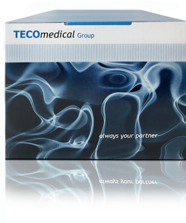
Catalogue No: TE 1076

Für weitere Informationen wenden Sie sich bitte an: For further information please contact: Pour plus d'information, veuillez contacter: