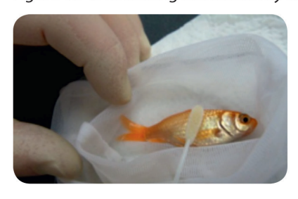
Figure 1a-c: Collecting fish mucus by using a swab.