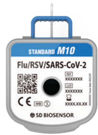
STANDARD™ M10 Flu/RSV/SARS-CoV-2